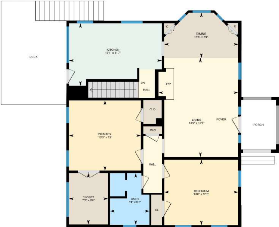
Main Floor Finished Area 1241.65 sq ft

Main Building: Total Finished Area 1677.07 sq ft