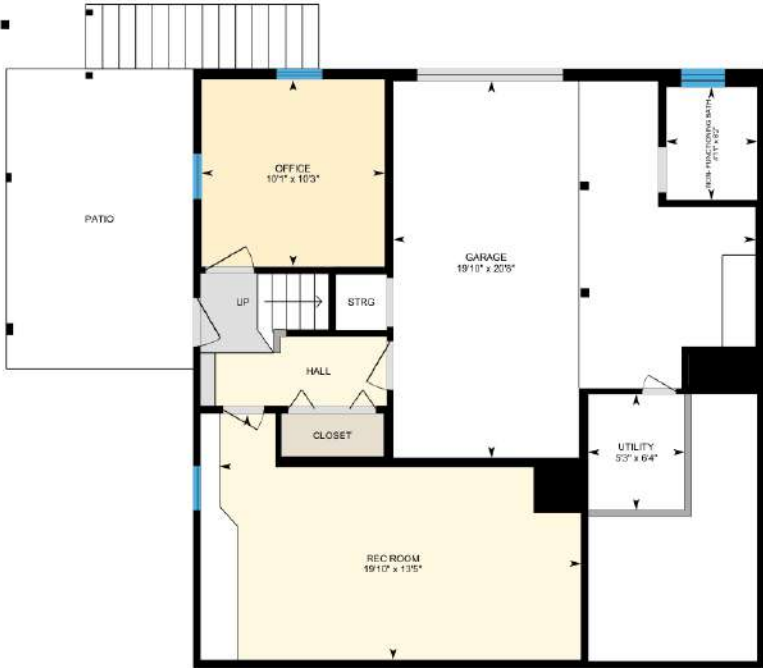
Lower Level (Below Grade) Finished Area 435.42 sq ft